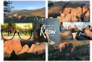
Colossians – Perspective “IN CHRIST”