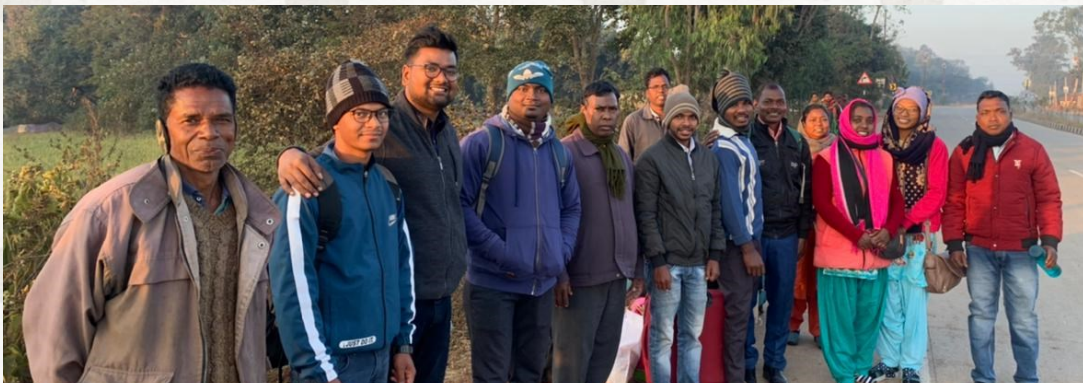
Final year students waiting for public transport bus to travel 5 hours to the neighboring state. They are visiting new Christians where some of our graduates are serving as missionaries among the Oraon people group.