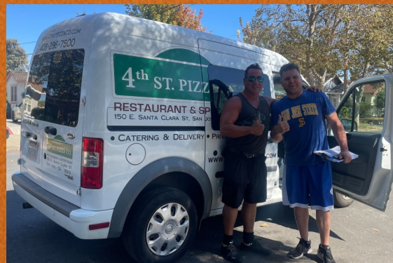
PHOTO: New mini Mercy Mobile

Finally, I would like to extend a resounding and heartfelt thank you to all who have supported our frontline efforts throughout the years. We were able to buy an efficient transport van for the upcoming cold-weather months THANKS TO THE INCREDIBLE GENEROSITY OF OUR FRIENDS AT ST. TIM'S. With the new "Mini Mercy Mobile," we will be expanding our efforts because we have two interns from Santa Clara University, three student volunteers from San Jose State, and two new staff members.