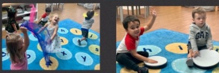
Music time pictures 9/8/23